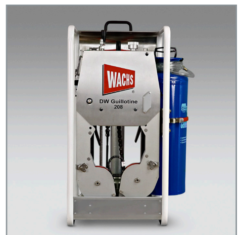
Arms collapse for compact storage. Optional wheeled carrier shown.