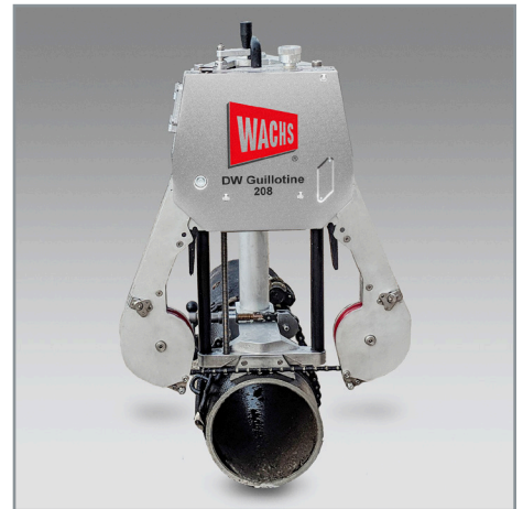
DWG saws mount securely to workpiece for safety