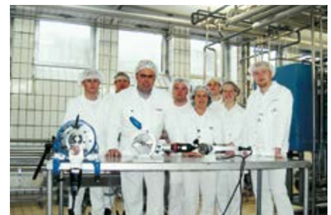
Widely specified in high purity applications