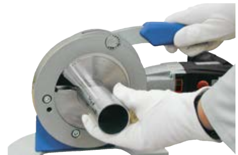
Quick clamping system for tools, clamping shells and tubes