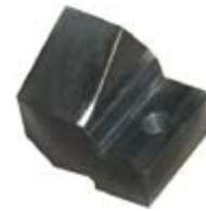
Tool holder WH