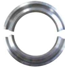
Aluminum clamping shells for RPG 8.6