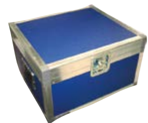
Including durable storage and shipping case